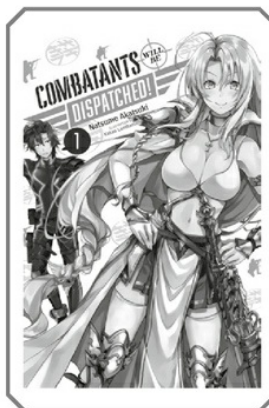
LIGHT NOVEL VOLUMES 1-6