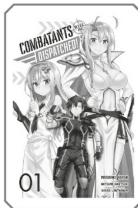
MANGA VOLUMES 1-5